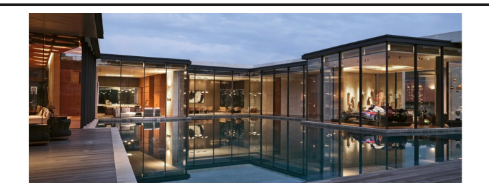
Published 22nd Oct 2024