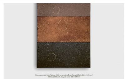
Homage to de Laun, Berlin, 2023, unpolierter Eisen, Pergament, Stahl, 45 x 104 mm / Tribute, 2023, unpolierter Eisen, Pergament, Stahl, 45 x 104 mm