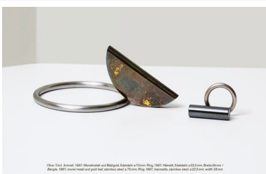
Ohne Titel, around 1987. Minimalist and Ringgold, Edelstahl & Bronze, Ring 1987, Edelstahl & Bronze, 200 mm, Bronze 20 mm / Ohne Titel, around 1987, minimalist and ring gold, stainless steel & 75 mm, Ring 1987, stainless steel & bronze, 200 mm, with 20 mm